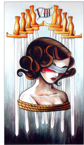
Drawing No. 11