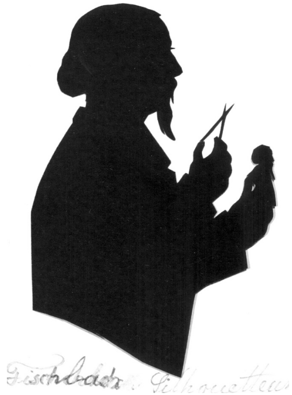
Silhouette Self-Portrait of W. Fischbach, 1875-99, Cut paper on paper, 8.5x7cm (3 3/8x2 3/4in.) RKD—Netherlands Institute for Art History, The Hague

contemporary art, in terms of the bold, imaginative ways artists are conceptualizing silhouettes today.